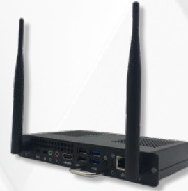
OPS On-Board Computer - UC Ready Z Pro Series Only