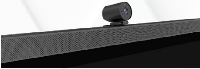
4K AI Camera - UC Ready Z Pro Series Only